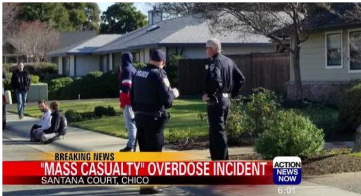
January 12, 2019