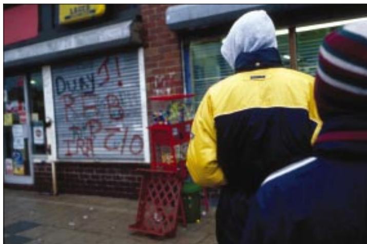
The community may identify factors such as discarded syringes and graffiti as important determinants of health, but these are difficult to quantify

These issues, although not addressed in the existing literature on health impact assessment, are not new. There are few references to work in the United States, where for the past 50 years social scientists have attempted to evaluate many arenas of social policy. 24-16 These researchers have already begun to wrestle with the problems of assessing the impact of “comprehensive community initiatives” and have developed rigorous frameworks for incorporating qualitative data gained from community consultation exercises into predictive and evaluative cause-effect models. 25-17 These techniques—and existing quantitative epidemiological techniques such as cluster randomisation, time series measurement, and bayesian and decision analysis modelling—need to be incorporated into health impact assessment. 26