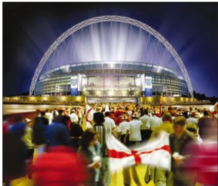
Health impact assessment for a new Wembley Stadium might involve consultation with key stakeholders such as the Metropolitan Police, England manager Sven Goran Eriksson, and minister for sport Richard Caborn

Given the flaws in the process of health impact assessment outlined above, how confident can we be that the predictions of health impact used to change implementation of policy are accurate? We need some empirical tests of the predictive process. Indeed, there is